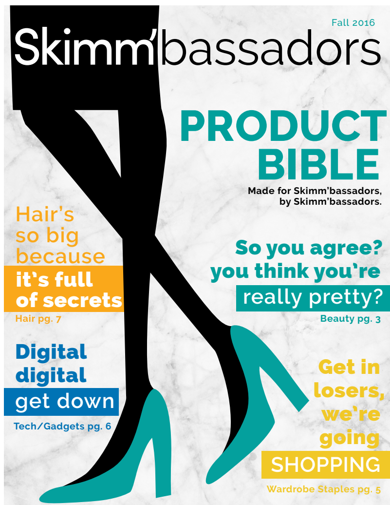
SKIMM'BASSADOR PRODUCT BIBLE