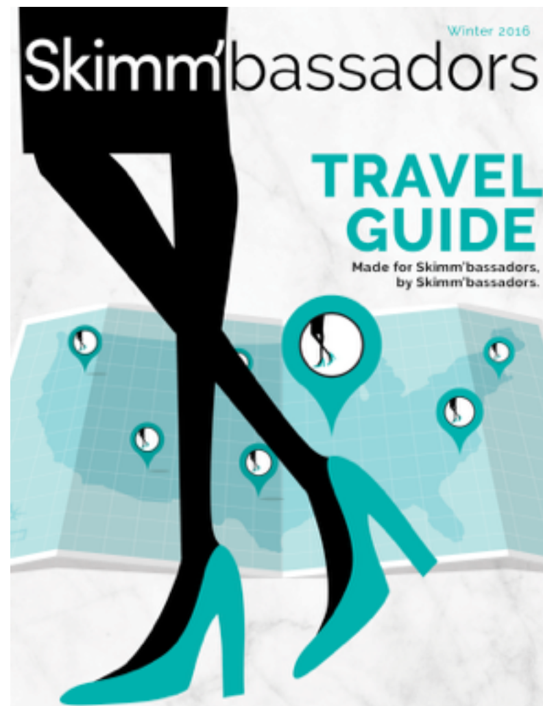
SKIMM'BASSADOR TRAVEL GUIDE